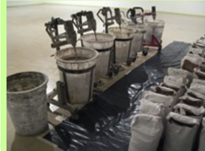
Durable Aluminium Structure